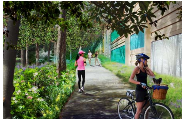
Near Loridans Drive at redesigned sound wall

The GA400 Trail is unlike any trail project in Atlanta. It winds through historic neighborhoods, natural areas, and the urban environment, connecting the elements of this community and making them more accessible than ever before. Families will soon be able to trade their 20-minute wait in the carpool line for a relaxing, 10-minute walk to school. Visitors staying at Buckhead hotels will be able to take an evening stroll to a top-notch restaurant, stopping in a gallery or two along the way. Neighbors will have new