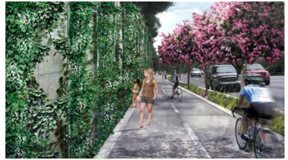
GA400 Trail along Lenox Road (Buckhead Loop) This view is looking east from the north side of Lenox Road. The wide path (resulting from narrower traffic lanes) permits safe pedestrian use of the area roughly across from “On The Border” restaurant.

Regarding construction sequence: The first stage of construction will be from Lenox Road to Old Ivy Road. Regarding financing: State, local and private capital will be used. No federal money is involved.