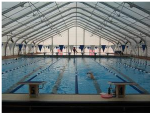
– Chastain Park Athletic Club